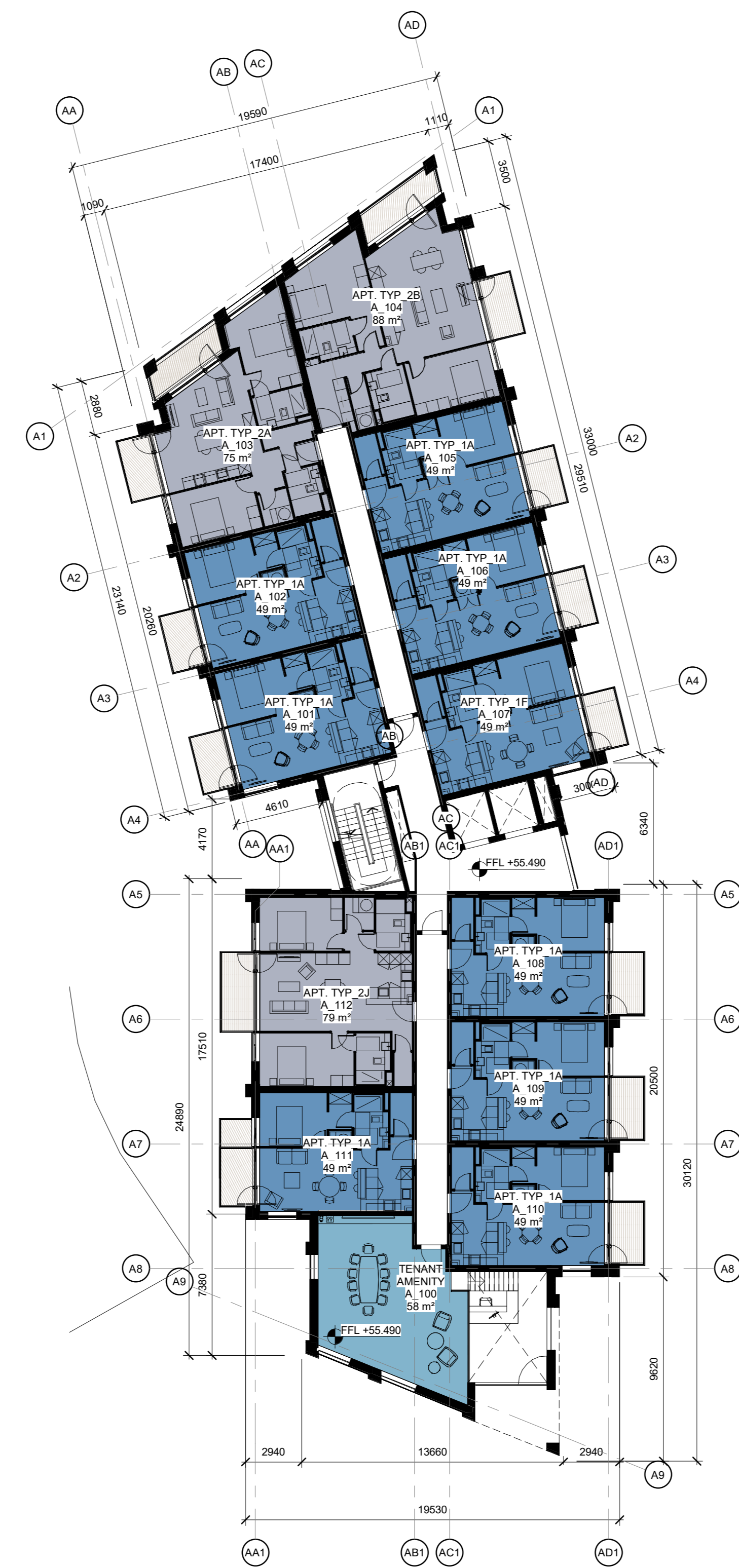
2 Building A -First Floor Plan 1: 200