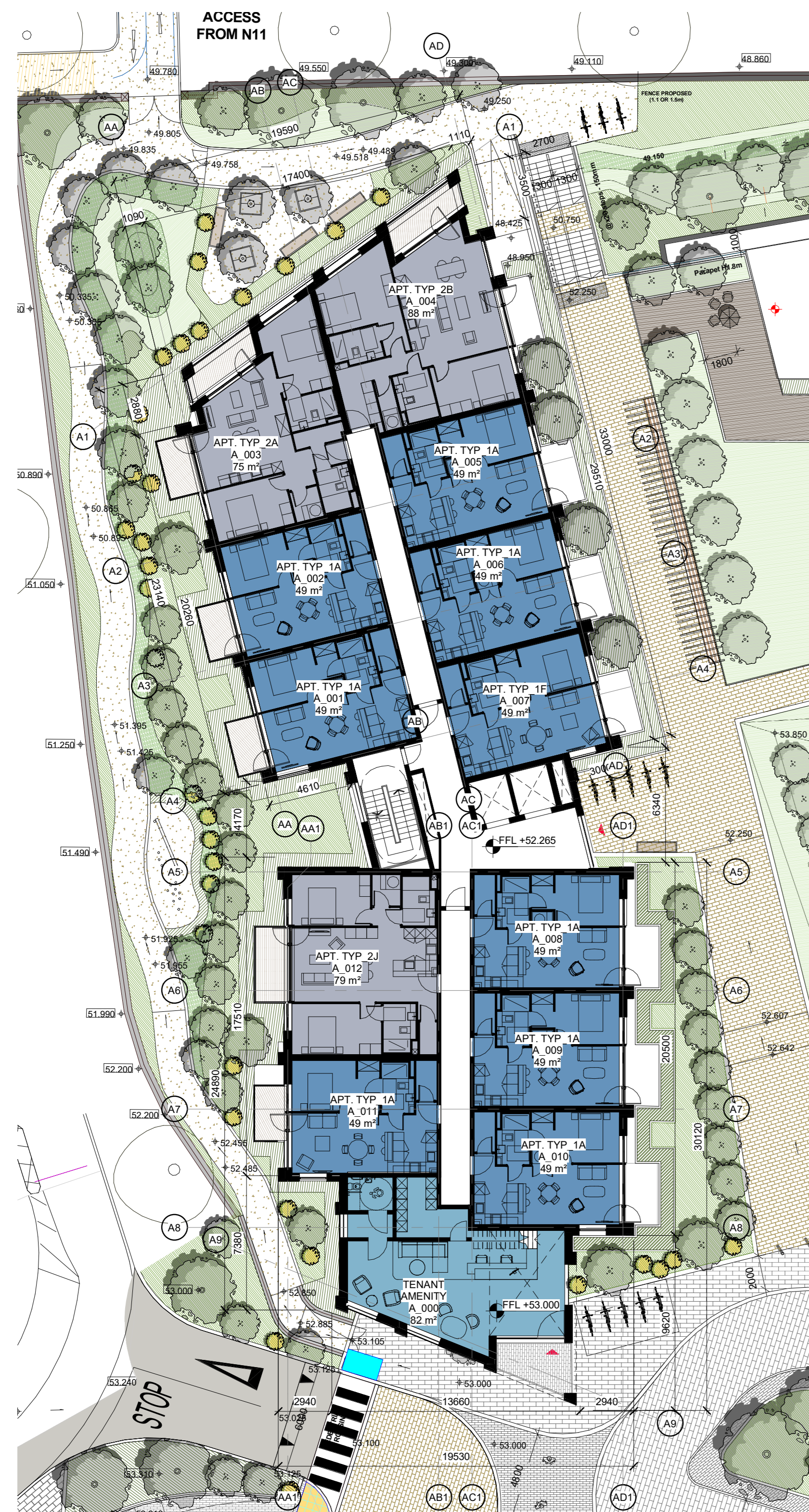
1 Building A -Ground Floor Plan 1: 200